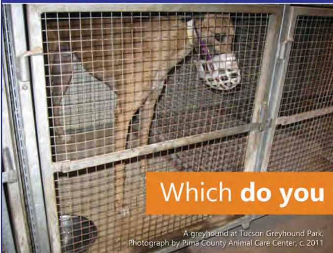
A greyhound at Tucson Greyhound Park. Photograph by Pima County Animal Care Center, c. 2011

A racing greyhound spends 20 hours a day in a cage