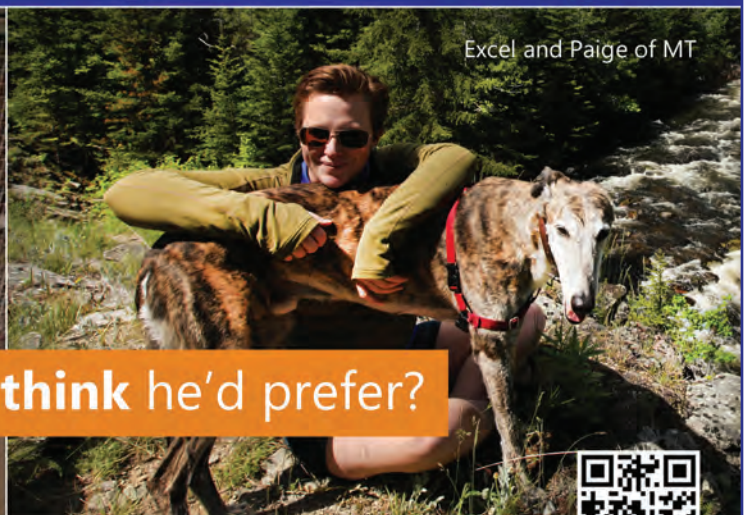
Excel and Paige of MT